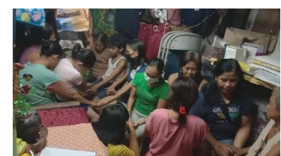
2 Bible reading meetup