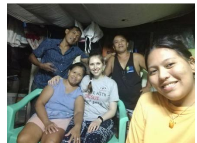
1 Reunion with family Geocada