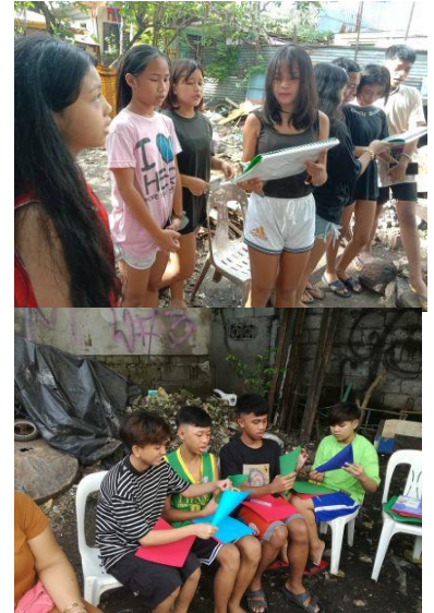
11 Youth group