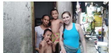
9 House visitation