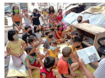
Children's ministry in Libjo

After my first stay in the Philippines in 2012/13 I wrote a short story, in which I processed my experiences there in a metaphorical way. There, I identify with a bird of passage – a wild goose. Interestingly, right in front of my student apartment there is a sculpture portraying rising wild geese. What is more, at the Lake Aa I could already gaze at many migratory birds. And now, God, the great migrant bird dad, sends me on my way again. The time long-awaited has come: On the 8th of September I started my flight from Amsterdam to Doha (Qatar) and further to the Philippines and I will stay here until the 4th of October. I was incredibly excited already beforehand to see the people again I have gotten to love there. I aim to foster relationships with the people of Libjo, with my collaborative partners in Baseco and Alabang, and with my local church, First Love Church, as well as to encourage people in their faith. I want to encourage them to grow in discipleship of Jesus. I also hope to have new encounters where I can share the love of God in word and deed and spread the hope in Jesus. I am of course open to what situations arise where social help is needed, for example for the sick and the poor. In addition, I would like to organize a children's program again a few times. I already arrived and I am glad that I also found a safe accommodation very close to Libjo. Let's go!