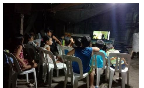
Livestream of the wedding in Libjo