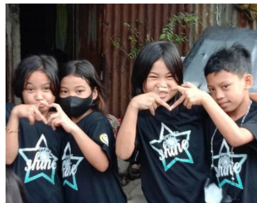
Children in Libjo

This year, I did my semester of internship as part of my studies of the Master of Education at a grammar school with a Catholic responsible body of the missionaries of Mariannahill. I was able to make many new experiences in teaching there. Because of a long time of commuting to get there and a high demand of work, that semester required much of my time and focus, and I didn't manage to get so much else done. But at least, I was able to recover my strength a bit during the lecture-free period in summer, aside of writing term papers I had to hand in at university. Now, I am doing four courses and my master's thesis before hopefully finishing my studies soon. I am likely to write my master's thesis about a Filipino novel in Spanish.