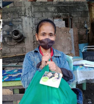
The joy of Christmas for young and old