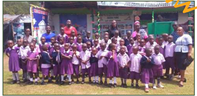
Academic Trip to Kitale Nature Conservancy Ndura Park