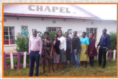
Social Work Dept.