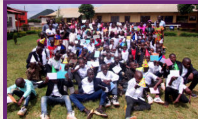
Thank you for the birthday cards!