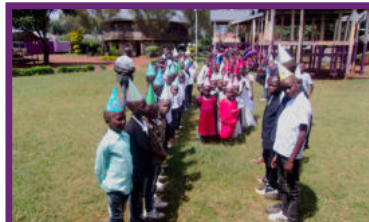
Birthday entrance procession for the guests of honor – the Challenge Farm kids!