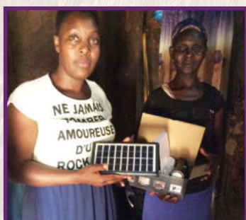
Providing solar lamps to our poor families struggling with lighting.