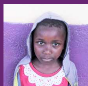
Faith #367, age 6