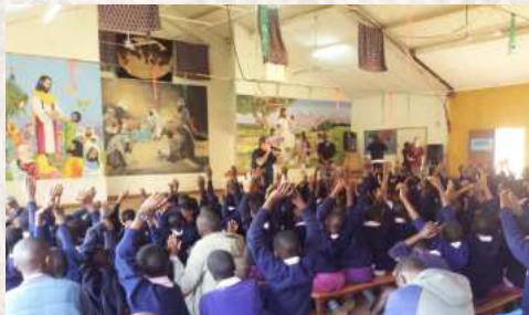
A team from Christ of All Nations came to minister to the children and staff. Some of our kids and staff received Jesus as their personal Savior!