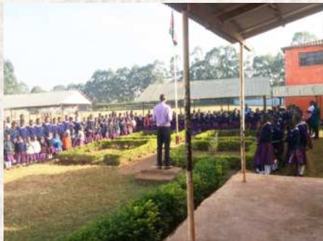
Friday morning school assembly at the flagpole.