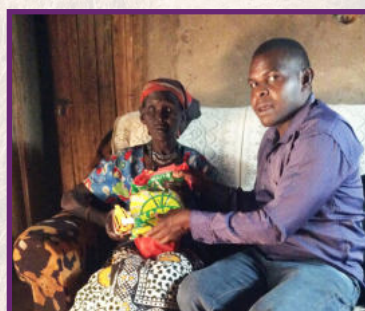
Families receiving a gift of sugar, tea leaves, cooking oil, and soap during a home visit assessment.