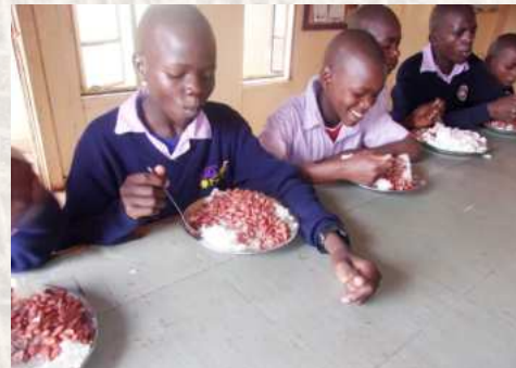
Boys with big appetites! They are enjoying their lunch of beans and rice!