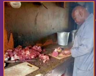
Meat on Friday!