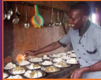
Rice and green grams (lentils) for lunch on the last Friday of the month!