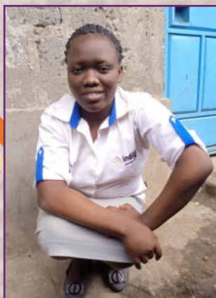
Mercy – Tailoring and Dressmaking

The girls were given a sewing machine, fabric, and salon items to help them get started in their new careers! Congratulations!