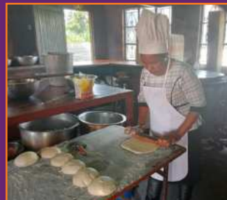
One of our cooks preparing to make chapati.