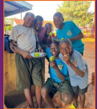
Fruits on Fridays!