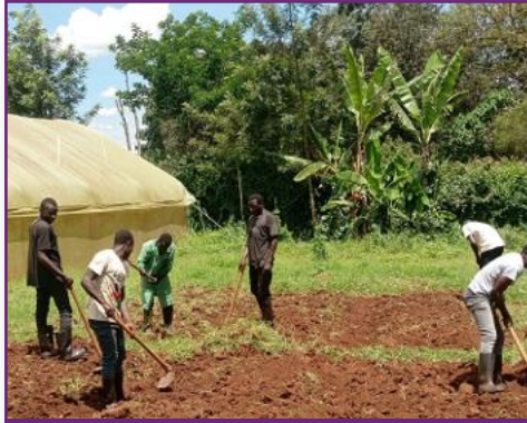
LEARNING AGRICULTURE SKILLS