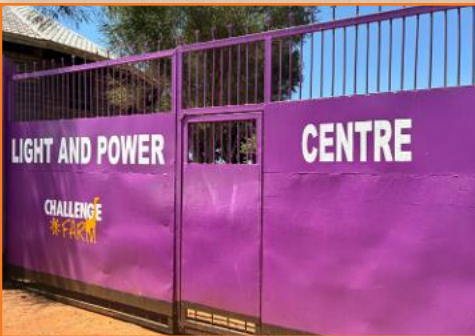
A fresh coat of paint on our front gate!