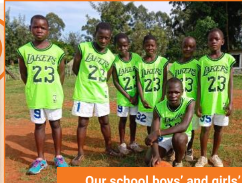
Our school boys' and girls' basketball teams. One of the teams advanced to the zonal basketball competitions!