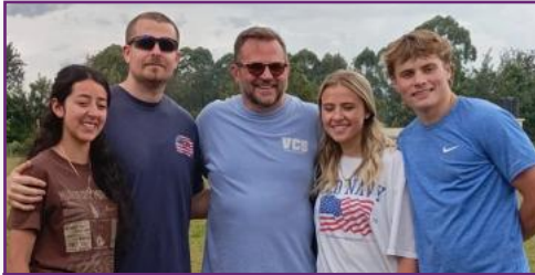
VICTORY FAMILY CHURCH TEAM