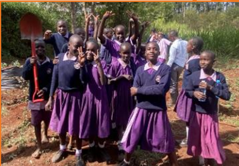
Our proud Agriculture Club!