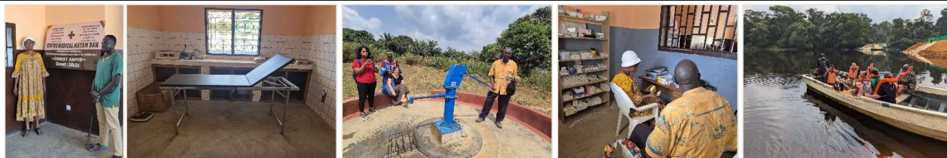
Health Centre – Surgery – Water for the village – Pharmacy – Crossing the river Njong