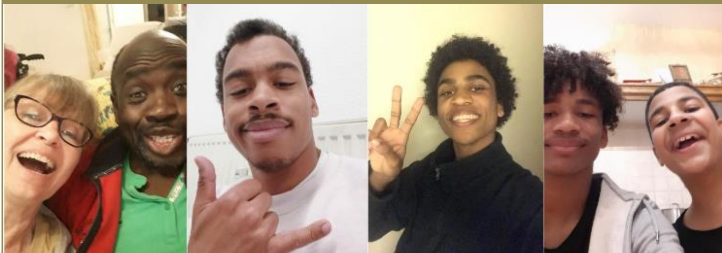
France, Cameroon, Germany, Norway... April 2022