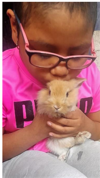
With her new rabbit.