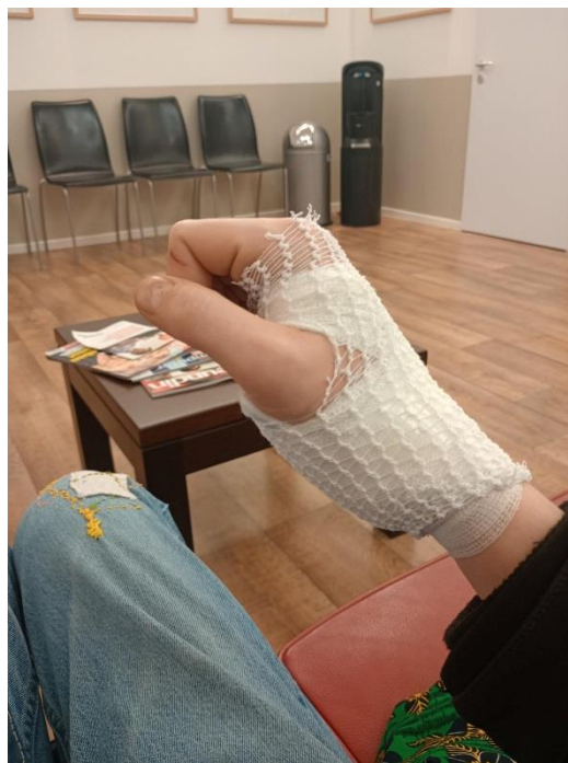
Carpal tunnel surgery on my right hand went well