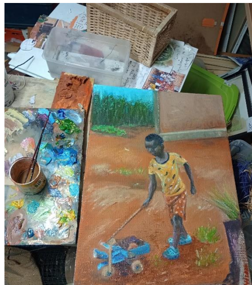
Crafts, art exhibit, „sending out service“, lunch and auction: The last weekend of April will be busy! Among other things, this painting will be in the show and part of the auction.

Why do people in Uganda carry so much on their head, and why do they love grasshoppers? If you have kids from around ages 5-12, or if you just like crafts, you can come to the FeG Heidelberg on April 25th from 2.30-5.30PM (Haberstraße 19, 69126 Heidelberg), for the „Africa-Creative-Day“: We will have games, stories, and crafts from Uganda (see the things you can make in the