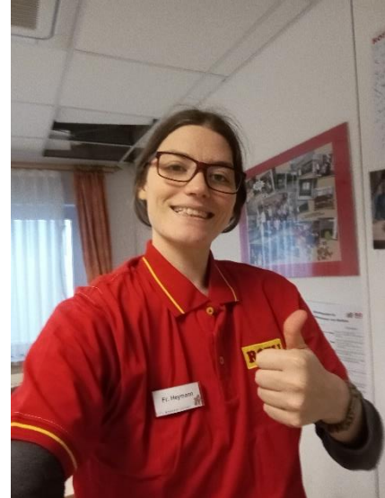
At the cash register, putting toys away or sweeping: The tasks vary, but I'm glad that I can do them without issue, as my health is improving

Even if I don't stay until summer, I'm grateful: The job is proving to me that my health is getting better, and that I can handle working with people several hours at a time. You can pray that God gives me strength and patience to pass on his love, even to people who aren't easy to love.