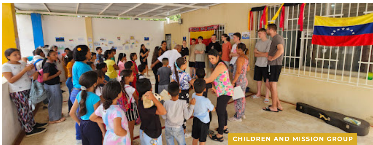
CHILDREN AND MISSION GROUP