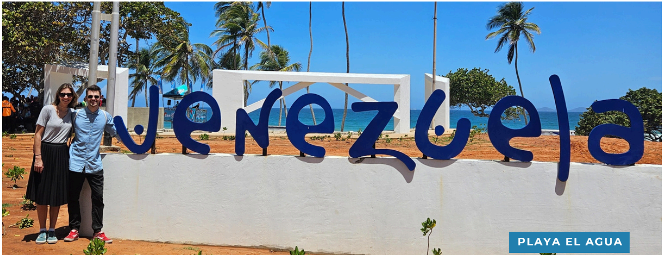
PLAYA EL AGUA