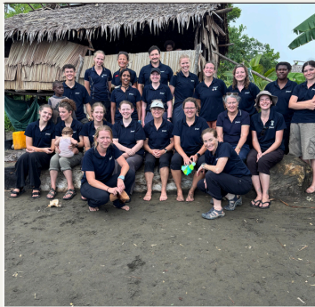
My primary healthcare team