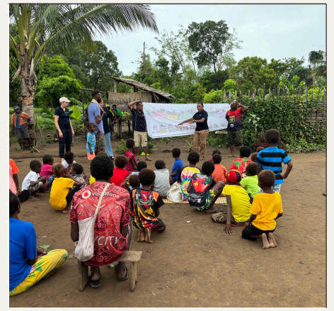
Our Bible engagement Team

After the holidays, I will prepare the ship for the next outreach and set out again to the Western Province at the end of January.